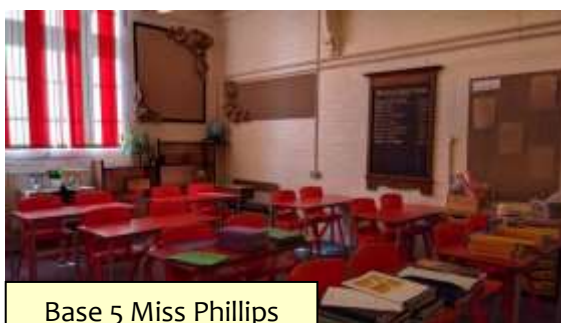
Base 5 Miss Phillips

Some of the teachers will be finishing getting the rooms ready next week so that when you come in you'll feel really 'at home' in your new classroom.