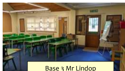
Base 3 Mr Lindop

Some of the teachers will be finishing getting the rooms ready next week so that when you come in you'll feel really 'at home' in your new classroom.